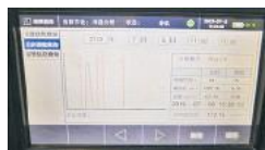
Photo of the main unit test spectrum